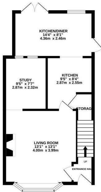
GROUND FLOOR 623 sq.ft. (57.9 sq.m.) approx.